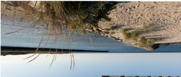
Red Jacket Beach Resort 1 South Shore Drive, South Yarmouth, MA